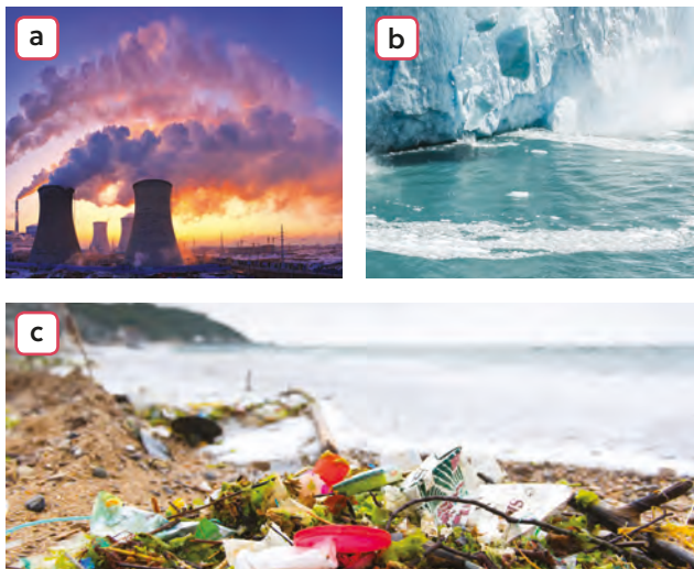
The first photo shows air pollution.

carbon emissions • climate change • drought • flood • fossil fuels • global warming • melting ice caps • (air/sea) pollution • (non-)renewable energy • sea level rise • toxic waste