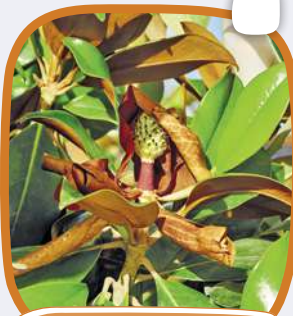
Dying plants in parks