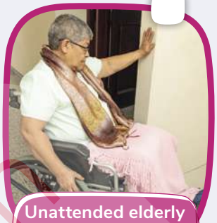
Unattended elderly citizens