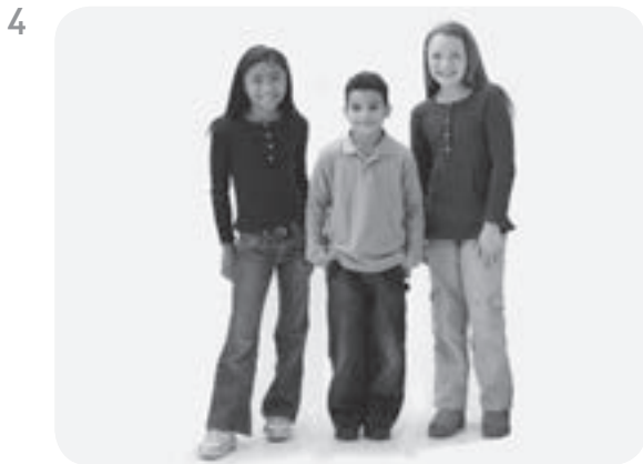
The boy is the short .