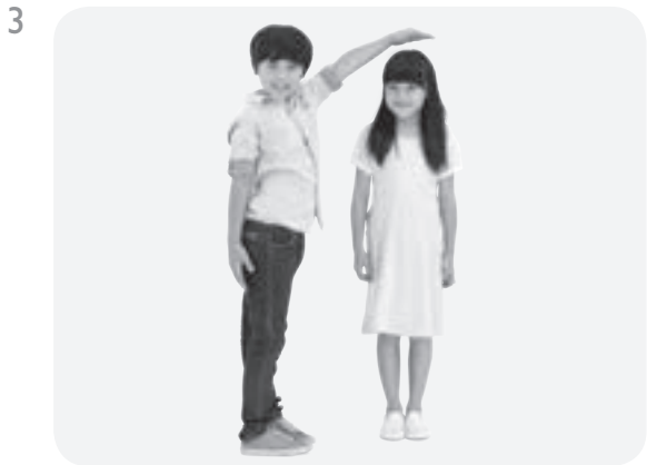
The girl is short than the boy.