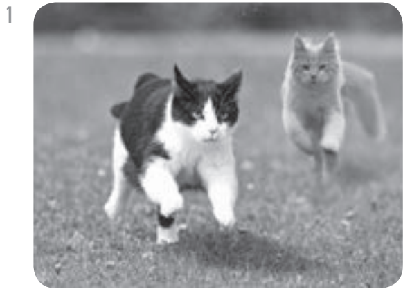
This cat runs fast e r than that cat.