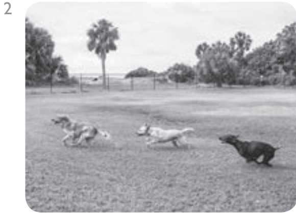
The black dog runs the slow .