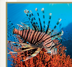
B Great Barrier Reef Marine Park, Australia