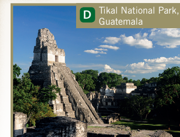
D Tikal National Park, Guatemala

Tikal is an amazing place with over 3,000 buildings from the Mayan civilisation! From about 900 BC to 900 AD, a major city of 100,000 people developed and you can still visit the ruins. The park is also home to jaguars and other animals. I visited with my class, and it was awesome to think we were walking in the footsteps of people from so long ago! The temples were very striking , but it was the courts for ball games that really stuck with me. It gave us some insight into what their lives were like. It's fascinating to think that they played sport just like us! We often look at constructions and monuments and think they represent what a culture was like, but my own view is that it's the ordinary aspects of everyday life that tell us a lot more.