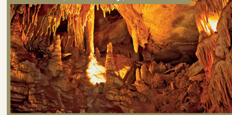
A Mammoth Cave National Park, Kentucky, USA

Four young people tell us about visiting a national park in their country.