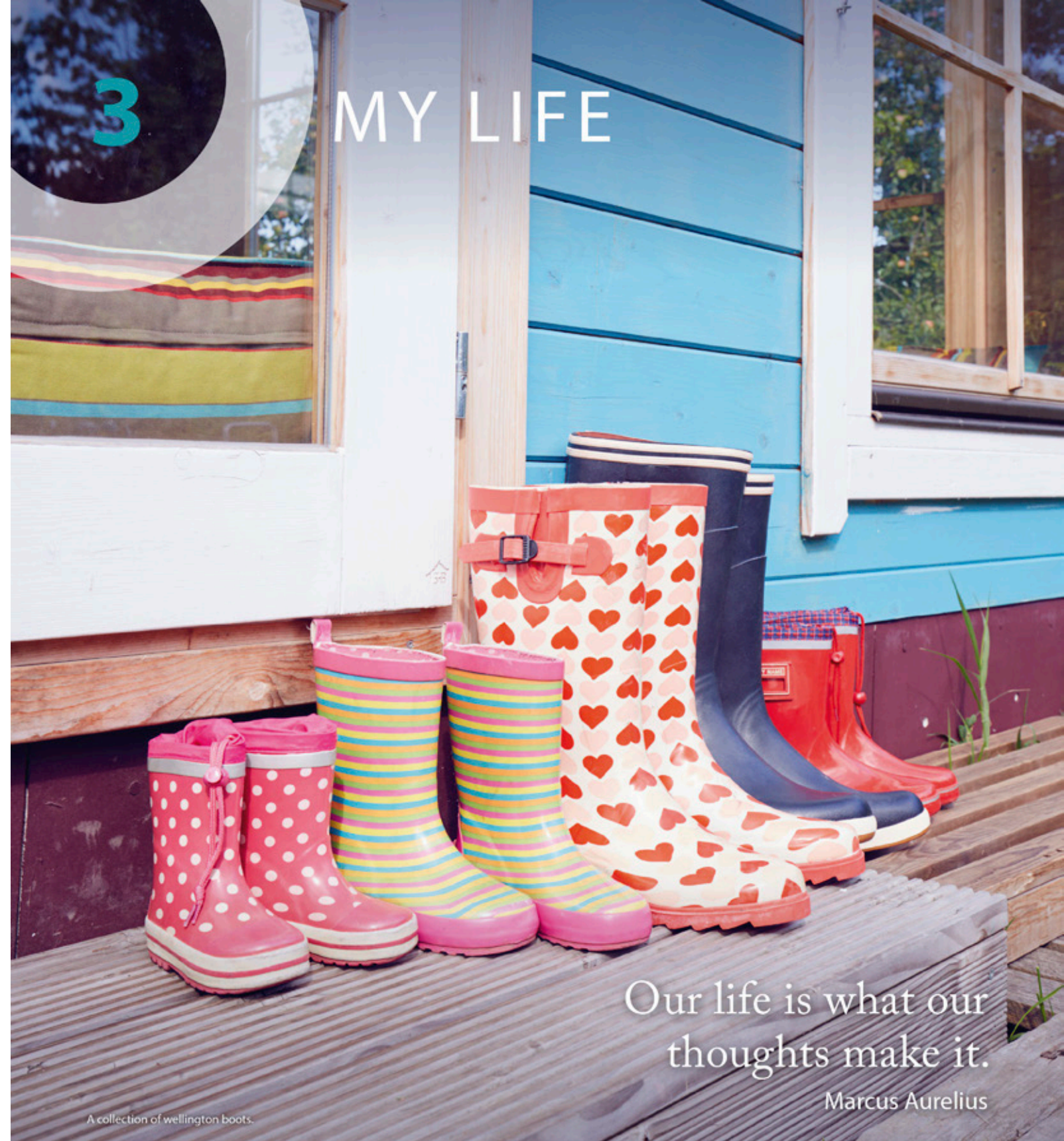
A collection of wellington boots.