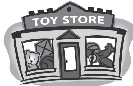
A toy store