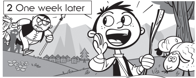
2 One week later