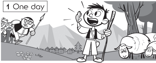
1 One day