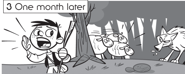
3 One month later