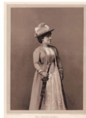
Frances Hodgson Burnett