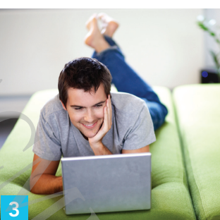
check my email