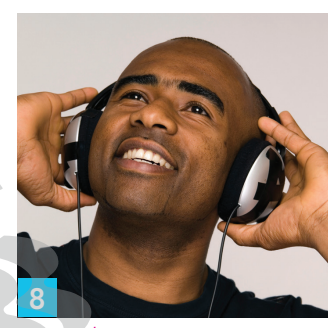
listen to music