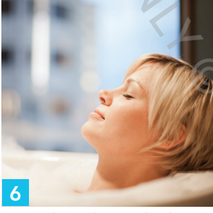
take a shower/bath