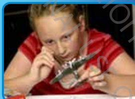
4 paint models