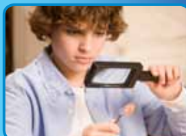
6 collect stamps