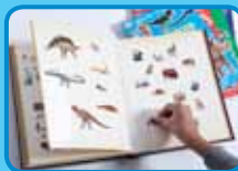
3 collect stickers