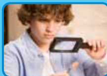
8 collect stamps