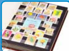
2 an album