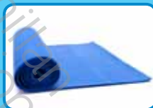
3 an exercise mat