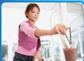
3 paint pictures