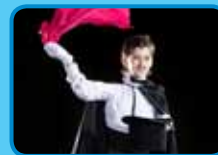
5 do magic tricks