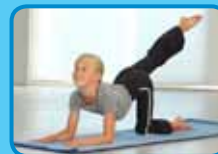
10 do exercise