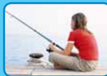
4 go fishing