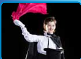
9 do magic tricks