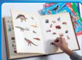
5 collect stickers