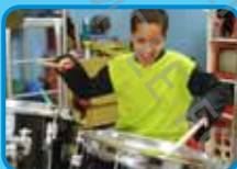
6 play the drums