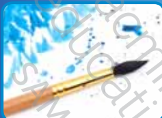
1 a paintbrush