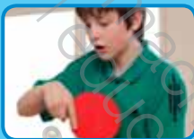
1 play table tennis