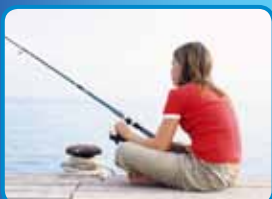
7 go fishing