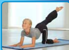
10 do exercise