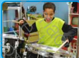
2 play the drums