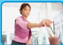
2 paint pictures