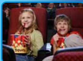
8 go to the cinema