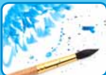
1 a paintbrush