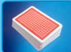
4 a pack of cards