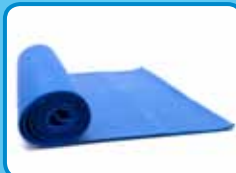
3 an exercise mat