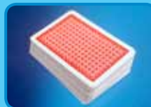
4 a pack of cards