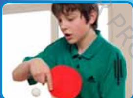
1 play table tennis