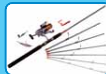
5 a fishing rod