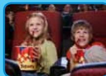
9 go to the cinema