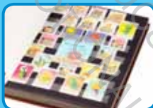
2 an album