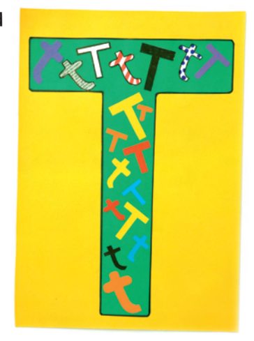
Lesson 6: Make a Letter Poster

The featured letter for this unit is Tt . Children practice reading and writing the letter and listening for the /t/ sound in the beginning of words such as taxi , telephone , toys , and train .