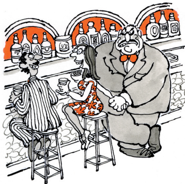
get to know