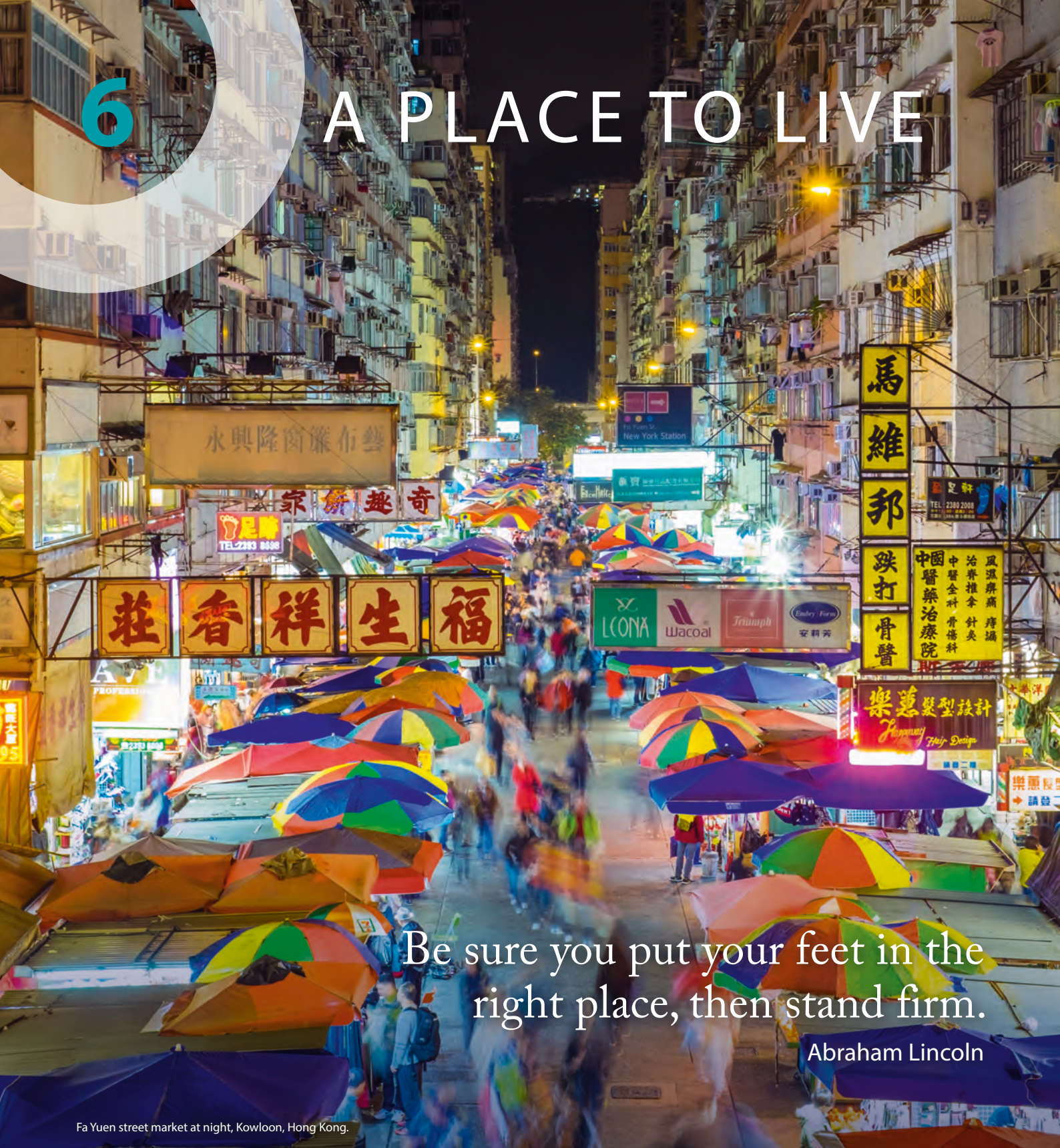
Fa Yuen street market at night, Kowloon, Hong Kong.

Be sure you put your feet in the right place, then stand firm.