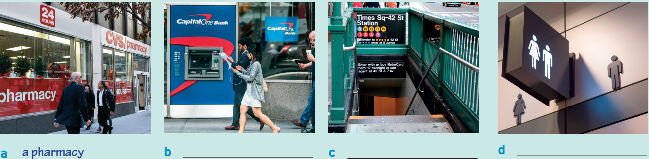
a a pharmacy b c d

an ATM a pharmacy a restroom a subway station