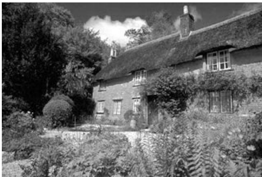
Thomas Hardy's home at Higher Brockhampton, near Dorchester.

Tess (France/UK 1979, directed by Roman Polanski, starring Natasha Kinski, Leigh Lawson, Peter Firth); The Woodlanders (UK, 1997. Directed by Phil Agland. Starring Rufus Sewell, Jodhi May, Polly Walker, Tony Haygarth, Emily Woof).