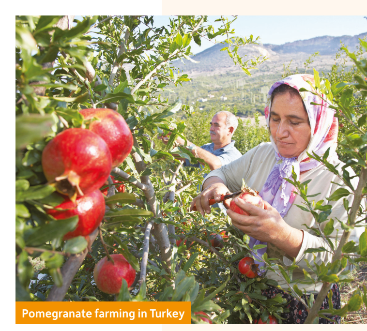
Food UNIT 2 41