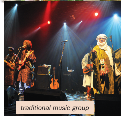
traditional music group