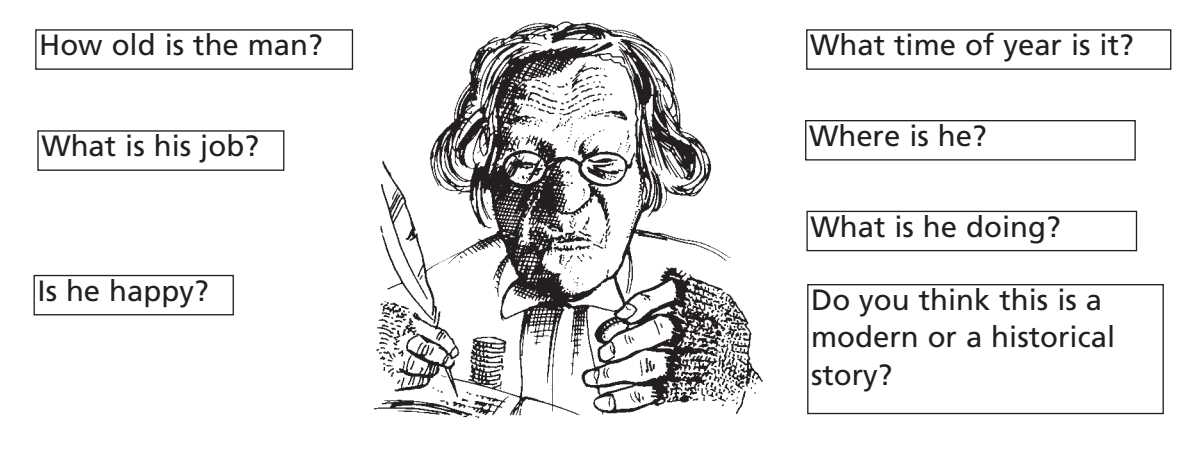
B While Reading

3 Here are the chapter headings for this story. Write a new chapter heading for each chapter after you read it.