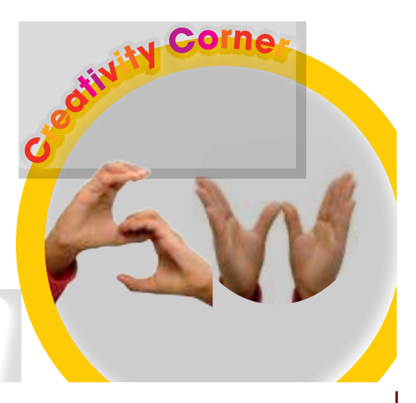
Do a role-play. Say: It's (cold). Put on your (sweater).